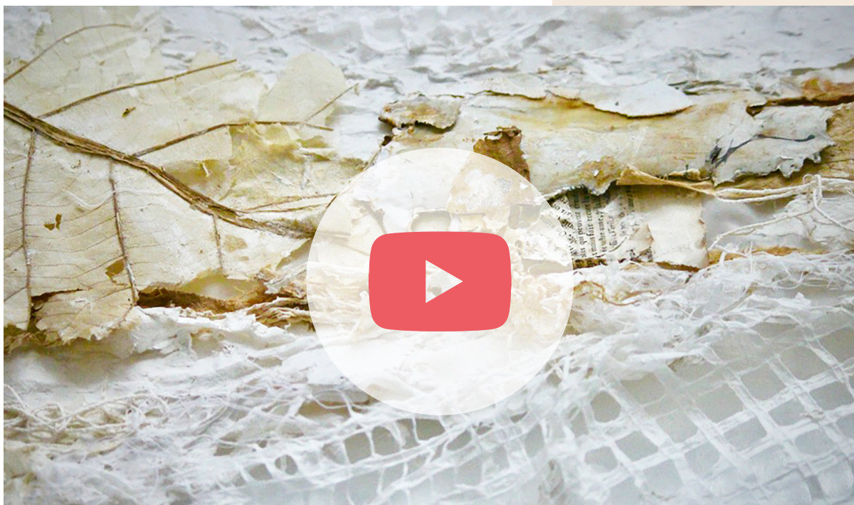
Research documentary of Amate paper making in San Pablito, Mexico.